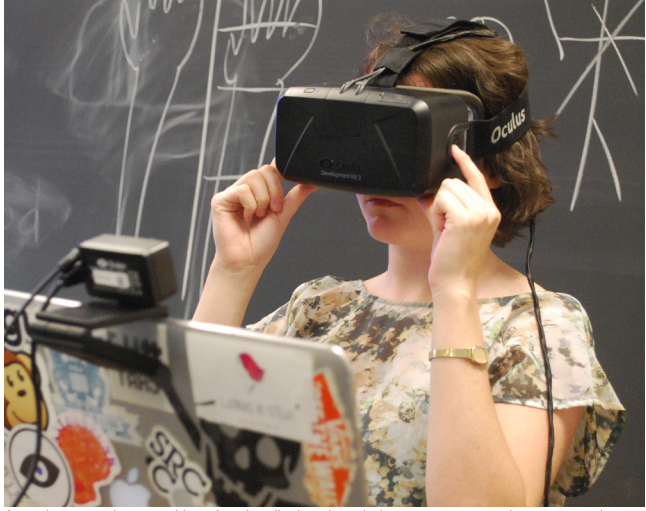
A student experiments with a virtual reality headset during a summer session on emerging technologies in journalism.